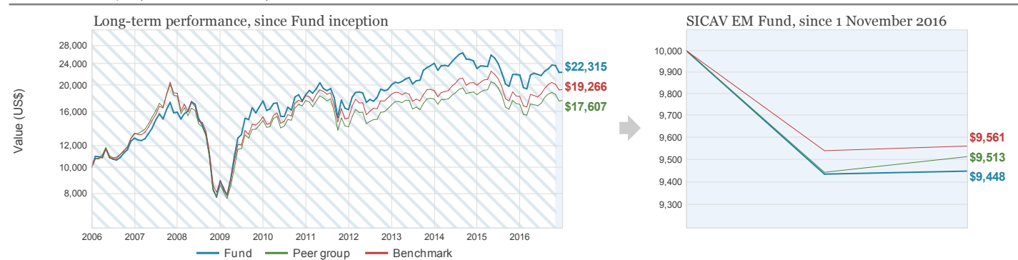
The striped area in the graph above relates to the performance of the Fund, and applicable benchmark and peer group, prior to the broadening of the Fund's investment strategy from Asia ex-Japan equities to Emerging Market equities on 1 November 2016.